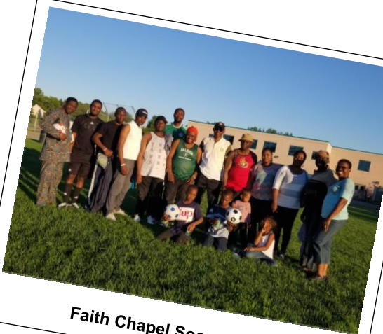
Faith Chapel Soccer Team