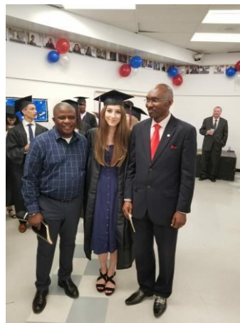
Scholarship Award by FC to the Best Mathematics Student at Sir Wilfrid Laurier Sec. School Graduation