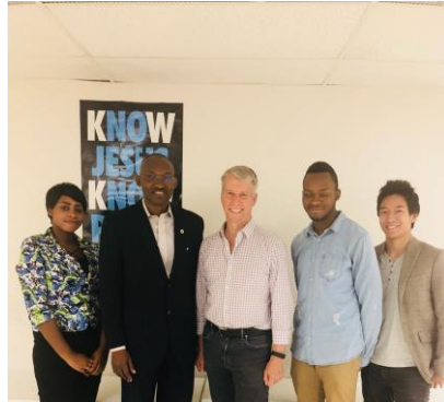
Summer Job 2018 Candidates