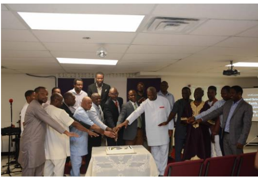
Father's Day Celebration 2018

We Honor the Lord for His faithfulness in this glorious Past Eight Years. To God be the Glory.