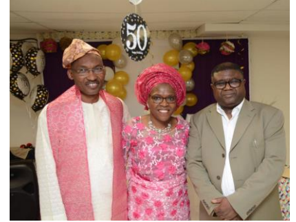
Celebrating FC First Lady's 50 th Birthday